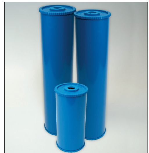
4.5" CARTRIDGE REPLACEMENT KIT