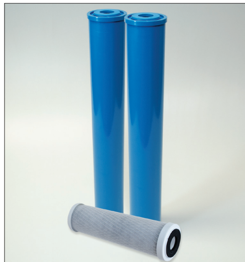
2.5" CARTRIDGE REPLACEMENT KIT